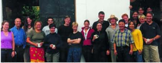
Students and staff outside our school