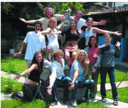
Students in school garden