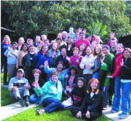
Students and staff in the school grounds

The host families are especially welcoming , providing basic but comfortable accommodation. The guest houses are ideal for students who wish to share accommodation with other international students. Each guest house has a kitchen for students to use, but a cook is available for those who do not wish to cater for themselves!