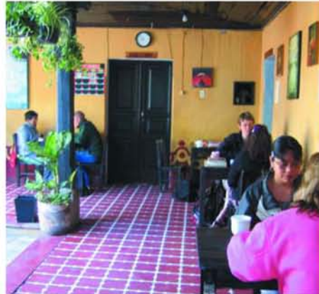
Spanish lessons around school courtyard