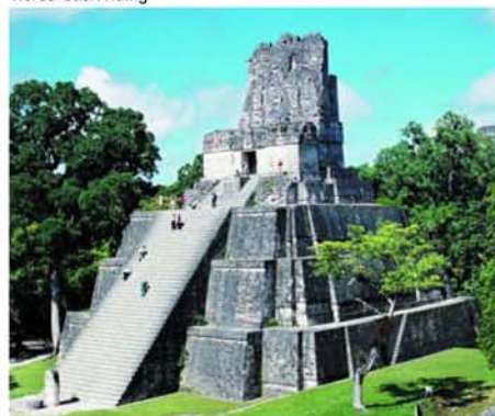
Nearby Mayan site