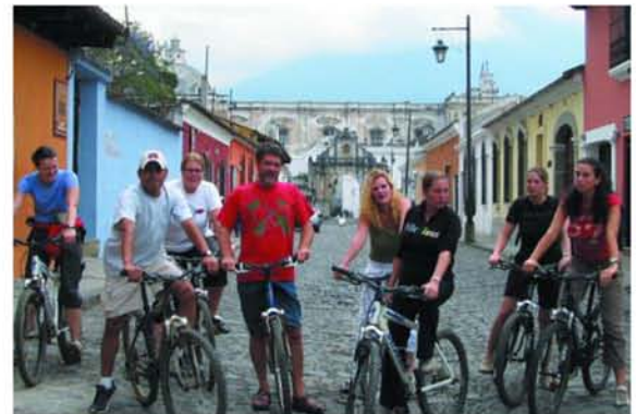
Students on cycling excursion