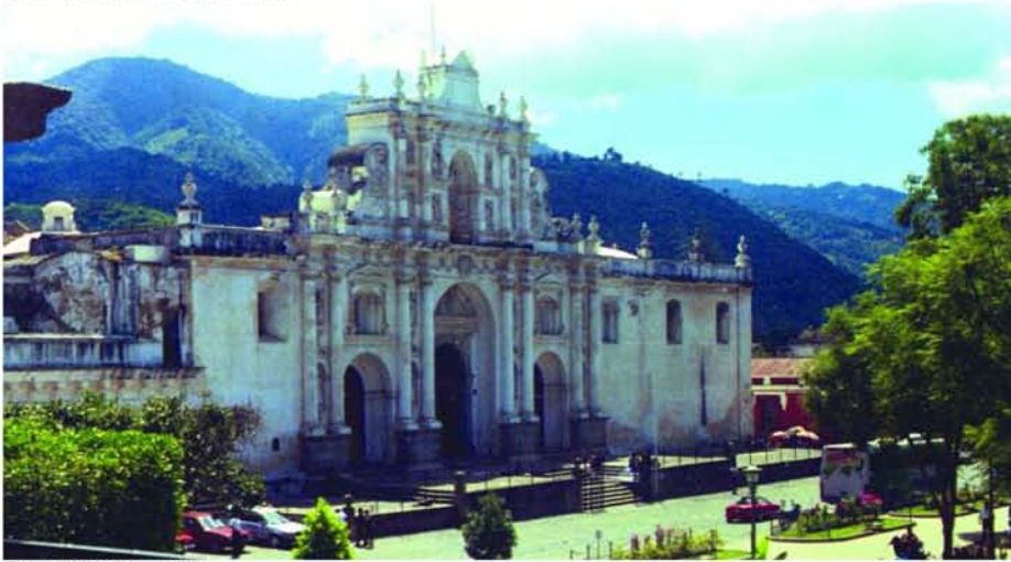
The Main Square - Antigua

Guatemala, home of the ancient Mayan civilization and still with a large indigenous population, is a beautiful and hospitable country. Antigua, surrounded by mountains and volcanoes, is one of the most enchanting colonial cities in Latin America. People are friendly and the cost of living is low, making Antigua an ideal location in which to learn Spanish.