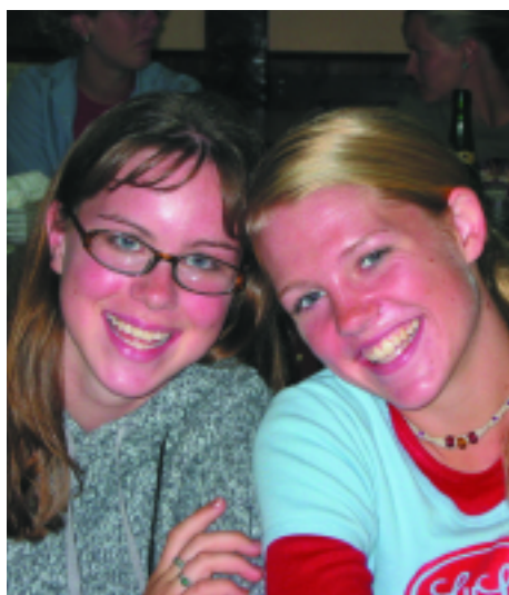
Students enjoying evening out