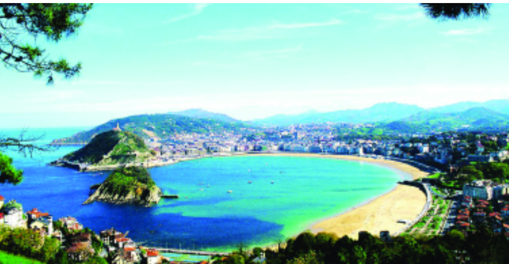
View over San Sebastian

Our school is located right next to the city's park, within easy walking distance of the beach and the old town. There are 15 spacious classrooms, a common room, Internet café and a student cafeteria. There's also a large sun terrace, where students meet at break time. You can combine your Spanish course with surf lessons, or with cookery lessons. Our school is an ideal base from which to explore the Pyrenees, the northern coast, and nearby cities Pamplona and Vitoria!!