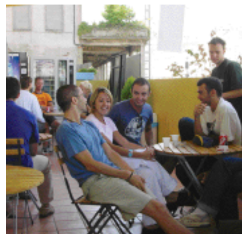
School terrace at break time