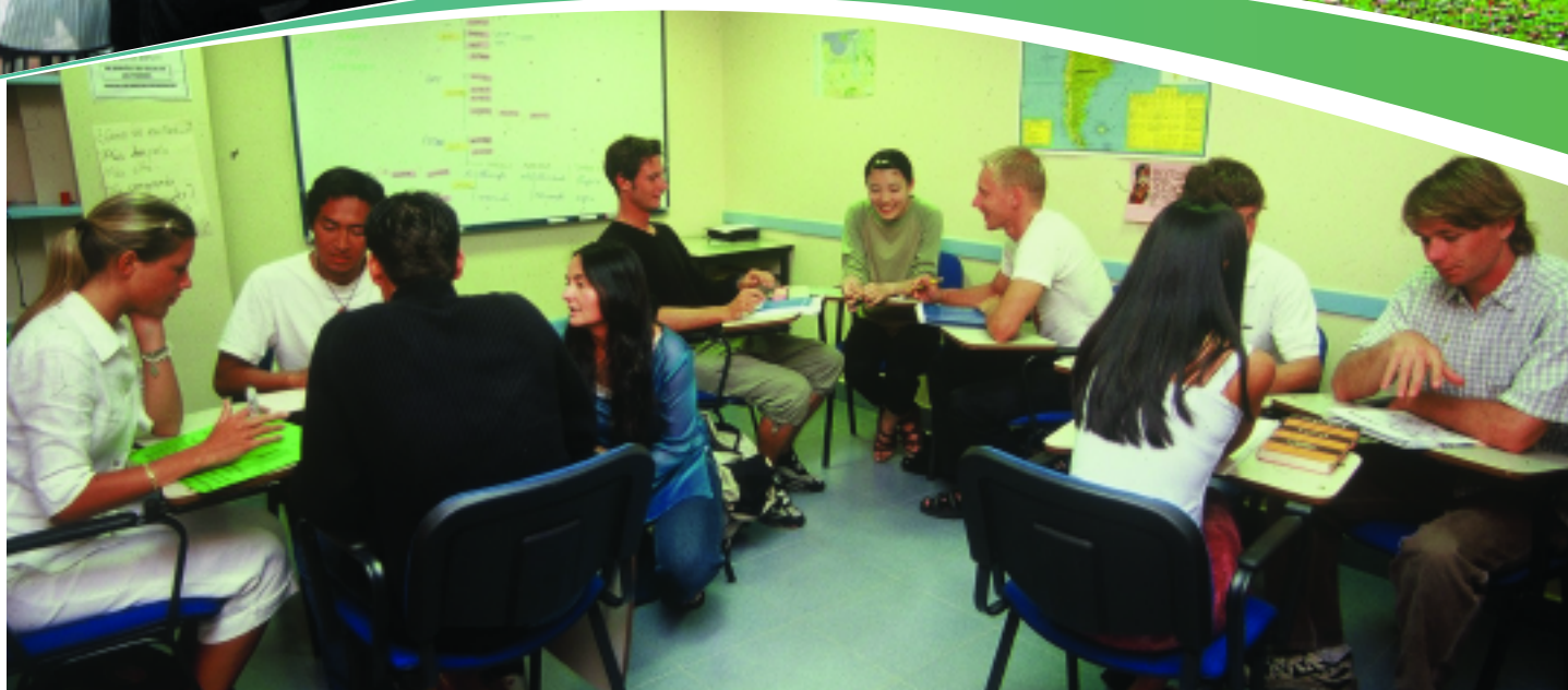
A Spanish lesson at our school