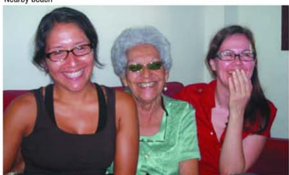
Students and host family