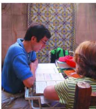
Spanish lesson at our school

Santiago de Cuba is the second largest city in Cuba. Lying in a large bay, at the foot of the spectacular 'Sierra Maestra' mountains, Santiago is known as the most 'Caribbean' and exotic town in Cuba. Here our students are placed in host families, and have classes in 'mini-groups' of a maximum of 3 students. Classes are held in teachers' homes, in host families, or else in a nearby Cultural Centre, always with a fully qualified native Cuban teacher.