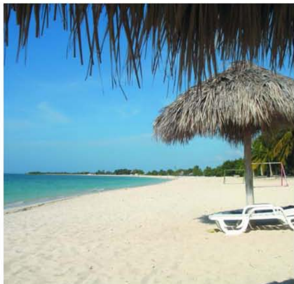
The beach, Trinidad