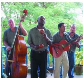
Music is everywhere in Trinidad!