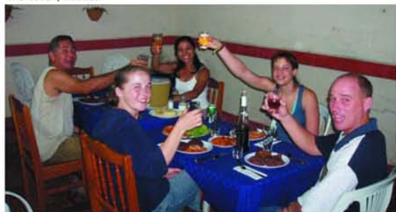
Students enjoying a meal together